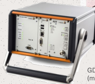
GDA-Sys Grid Dynamic Analyzer (mobile version) – DA-Box 2000