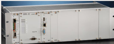
CPR-D Collapse Prediction Relay Patent WO 2005/088802 A1